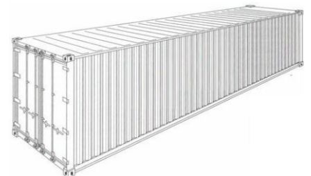
40 foot container